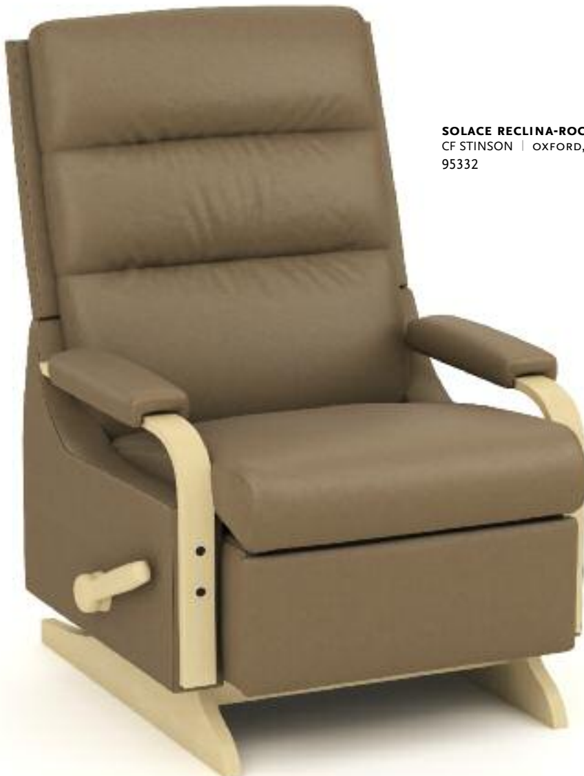
SOLACE RECLINA-ROCKER® CF STINSON | OXFORD, SPRUCE | NATURAL 95332