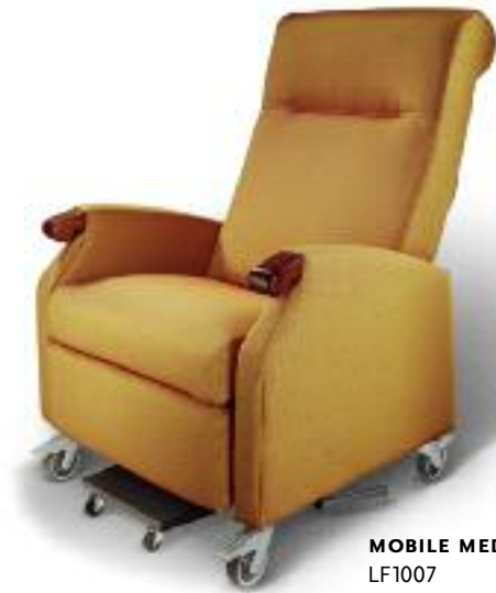
MOBILE MEDICAL RECLINER LF1007