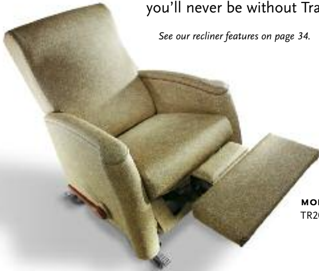
MOBILE MEDICAL RECLINER TR2007