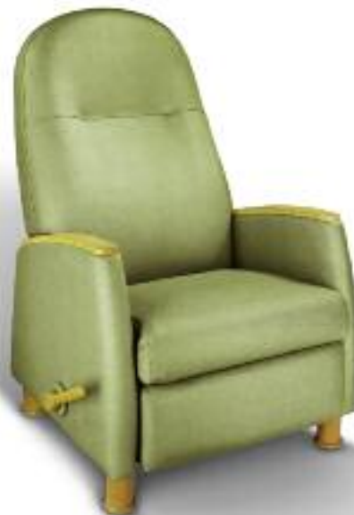
STATIONARY MEDICAL RECLINER CF STINSON | OXFORD, CELERY | HONEY MAPLE LQ1005