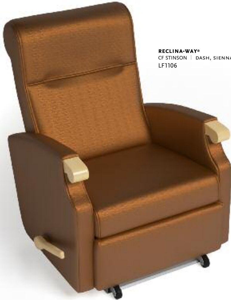
RECLINA-WAY® CF STINSON | DASH, SIENNA | NATURAL LF1106