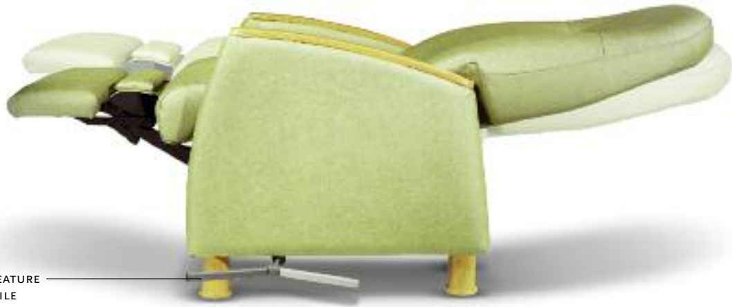
TRENDELENBURG FEATURE AVAILABLE ON MOBILE AND STATIONARY MEDICAL RECLINERS.