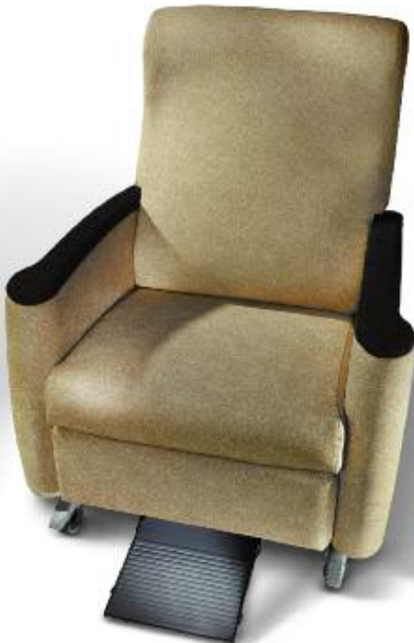
MOBILE MEDICAL RECLINER TR1007