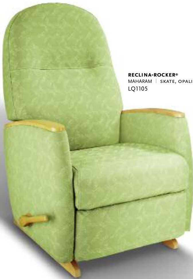
RECLINA-ROCKER® MAHARAM | SKATE, OPALINE | HONEY MAPLE LQ1105