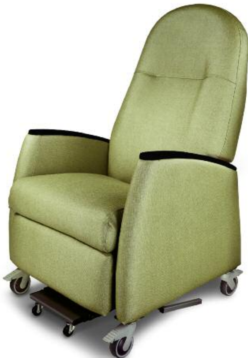
MOBILE MEDICAL RECLINER LQ1007