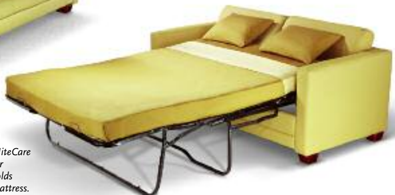
The Monroe NiteCare loveseat sleeper conveniently folds out to a full mattress.