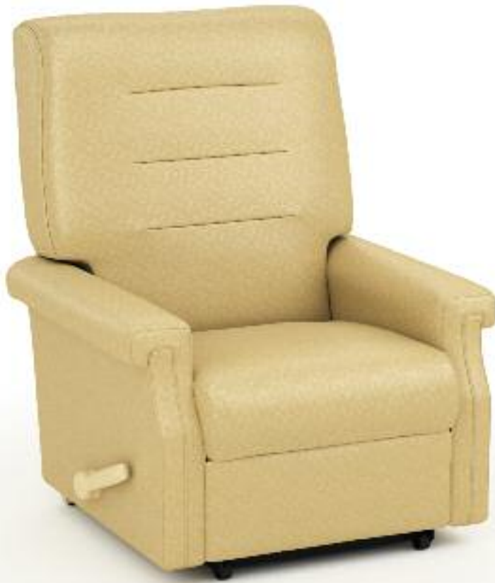
REGAL™ RECLINA-WAY® CF STINSON | APROPOS, CHAMPAIGN 96806