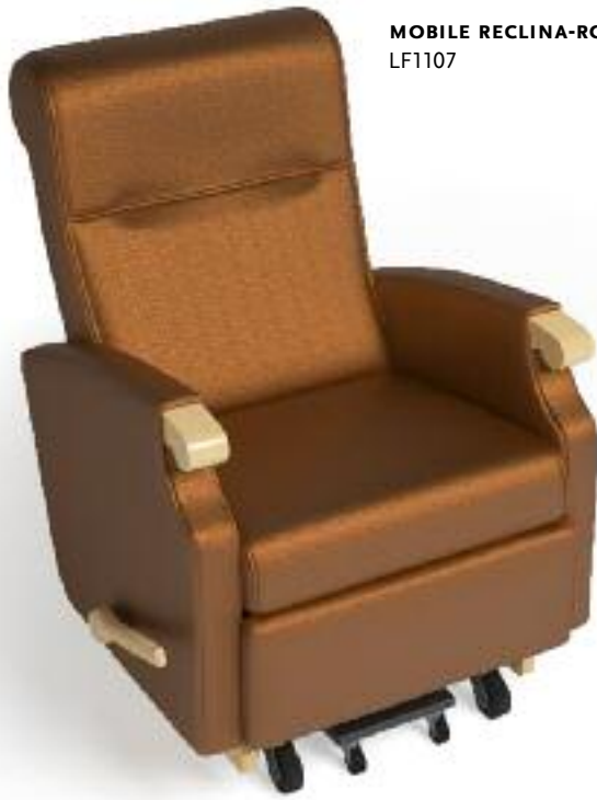
MOBILE RECLINA-ROCKER® LF1107