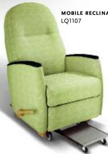
MOBILE RECLINA-ROCKER® LQ1107