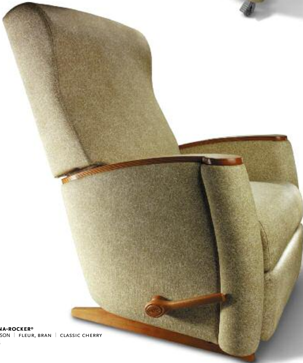
RECLINA-ROCKER® CF STINSON | FLEUR, BRAN | CLASSIC CHERRY TR1105