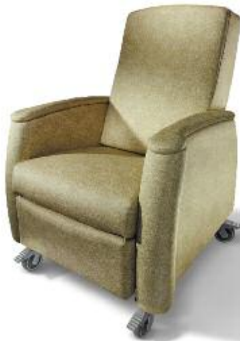
MOBILE MEDICAL RECLINER TR1907