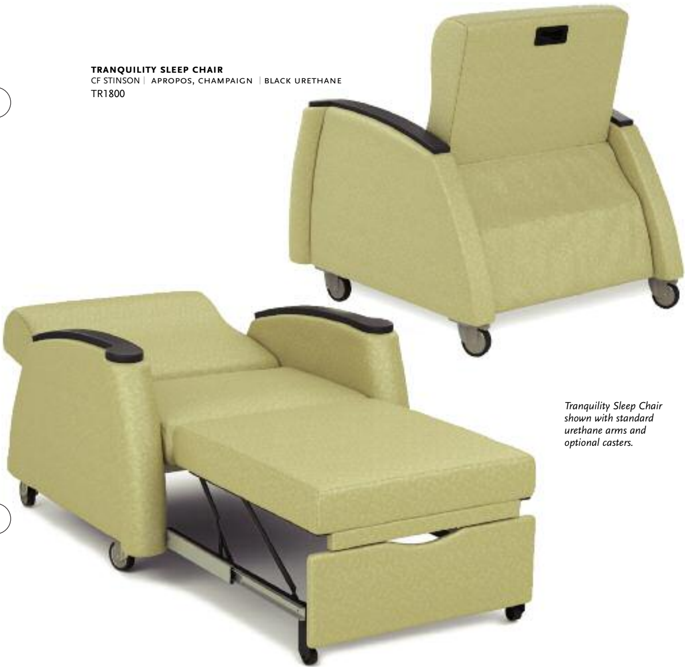
Tranquility Sleep Chair shown with standard urethane arms and optional casters.