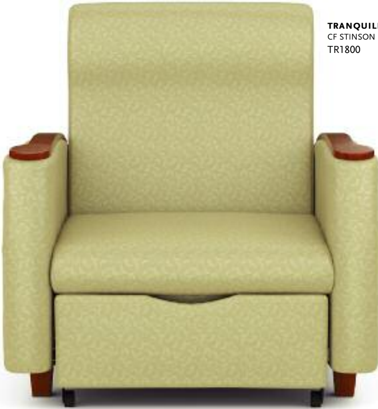
TRANQUILITY SLEEP CHAIR CF STINSON | APROPOS, CHAMPAIGN | DARK CHERRY TR1800

The Tranquility collection is versatile enough to comfort everyone. Like our Tranquility recliners, our sleep chair will help your patients find the support they need. And since we've taken the challenge out of something as simple as opening and closing the chair we ensure comfort for both you and your patients.