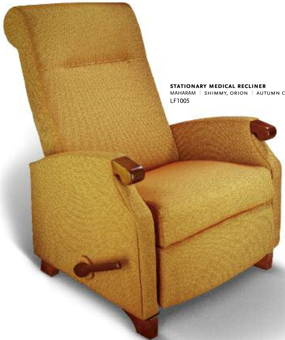
STATIONARY MEDICAL RECLINER MAHARAM | SHIMMY, ORION | AUTUMN CHERRY LF1005